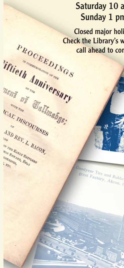
Goodyear Tire and Rubber Company's great Factory, Akron, Ohio.

Genealogy and Local History Resources and Services