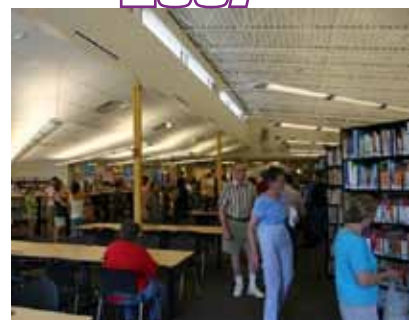
Highland Square Branch Library