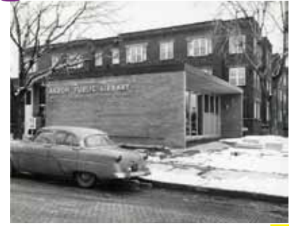
807 West Market Street