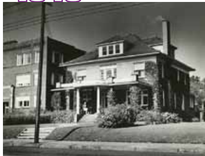
789 West Market Street