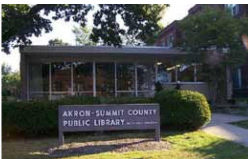
West Hill Branch Library