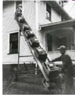
Moving materials to new location