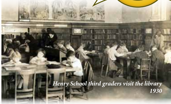
Henry School third graders visit the library 1930